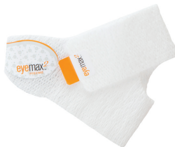
PREEMIE (10.4"-12.6") (Occipital Frontal Circumference)